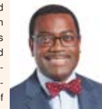
Dr. Akinwumi A. Adesina The Bank's 8th President

The Bank seeks to promote strong, shared and sustainable growth in Africa through five priority areas, which are referred to as the High 5s. These are: Lighting up and powering Africa; Feeding Africa; Industrialising Africa; Integrating Africa; and Improving the quality of Life for the people of Africa. President Adesina set out these five Bank priorities aligned with the 2013-2022 Strategy in September 2015, and subsequent 2024-2033 Strategy is designed to place the Bank at the center of Africa's transformation and to improve the quality of Africa's growth.