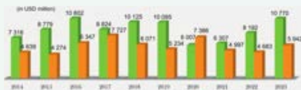
AfDB's approvals and disbursements